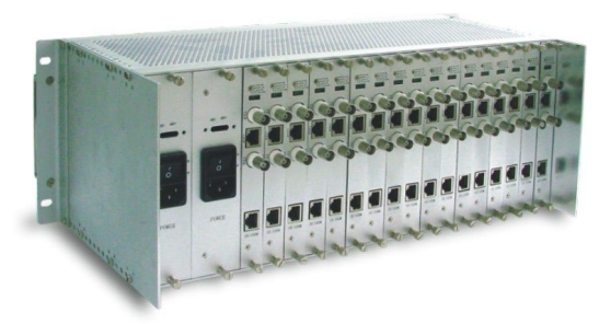
4U, 19 inch,16 slots Rack