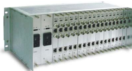
4U, 19 inch, 16 slots Rack